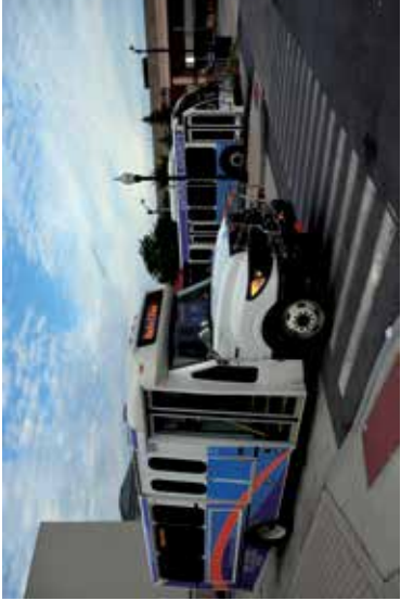
Register at DutchessNY.gov/PublicTransit

This complaint procedure does not prohibit a complainant the right to file formal complaints with the New York State Department of Human Rights, the New York State Department of Transportation, or seek private counsel for complaints alleging discrimination, intimidation or retaliation of any kind that is prohibited by law.